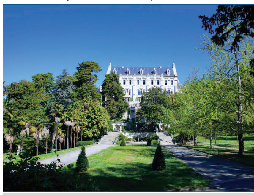
The Grand Château de Valrose where the conference took place

enzymes. Besides this, ISMEC 2024 included 32 oral communications and 34 poster presentations, ensuring that a wide array of topics and insights were shared. As is usual at ISMEC meetings, the participation of young scientists was actively encouraged and many of the oral communications were delivered by PhD students and postdoctoral researchers. All abstracts from the oral and poster presentations were compiled and published in the Acta of the International Symposia on the Thermodynamics of Metal Complexes, Vol. 13, the "ISMEC