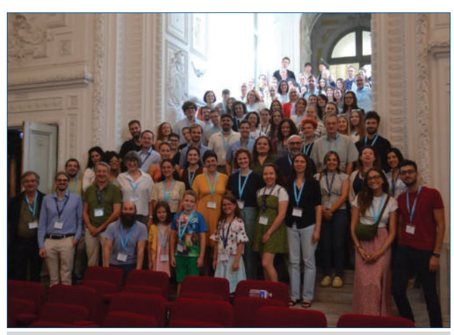
Group photo of participants to ISMEC 2024

Acta" (ISSN 2239-2459). This publication is available online via the ISMEC group website: https://www.ismecgroup.org/ismec-acta/.